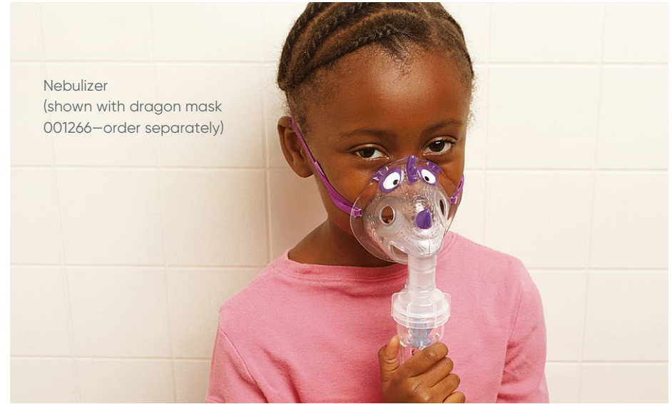
Nebulizer (shown with dragon mask 001266—order separately)

Delivering fast and effective treatment, more efficiently. Accommodating all types of patients in all types of situations. These were the forces behind the development of the Misty Max 10™ nebulizer. Featuring a new type of jet design, the Misty Max 10™ nebulizer can speed up treatment and help ensure consistent medication delivery while offering you more flexibility in treatment options.