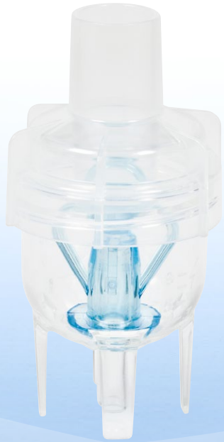
Misty Max 10™ Disposable nebulizer