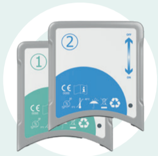
BATTERIES (2 SUPPLIED)