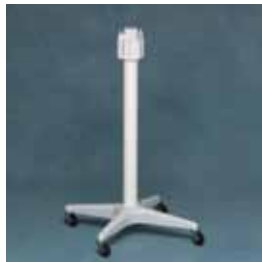
30 in. Roll stand

Roll stands allow flexibility in the location and configuration of Medi-Vac® canister (CRD™, Flex Advantage® or Guardian™ systems) installations.