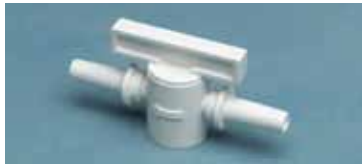
In-line vacuum on/off valve