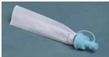
Large-port specimen sock