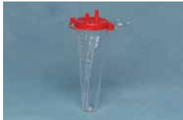
Universal critical measure