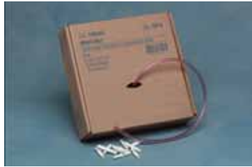
Bulk connecting tubing

Flexible, connecting tubing to adapt your system for various setups.