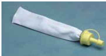
Female specimen sock