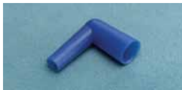
Right-angle adapter for Flex Advantage® patient port and CRD™ and Guardian™ ortho ports