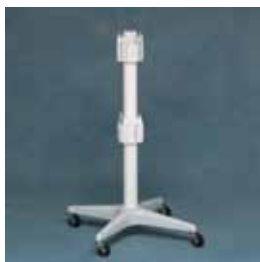
30 in. Eight-canister dual-head roll stand