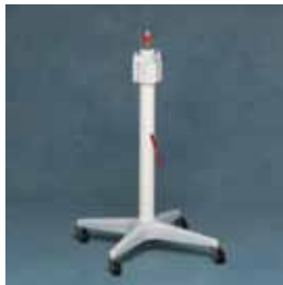
30 in. Roll stand with regulator mount