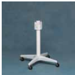
20 in. Roll stand