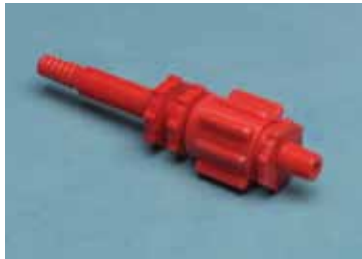
Universal female D.I.S.S.