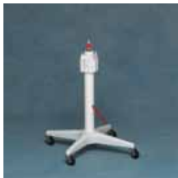
20 in. Roll stand with regulator mount