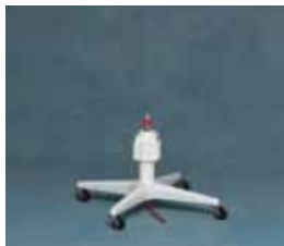
11 in. Roll stand with regulator mount